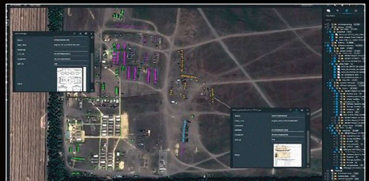
Detecting and identifying vehicles