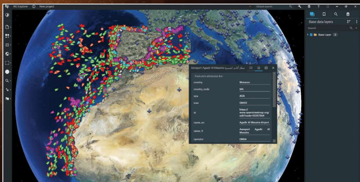
Tracking AIS at sea

I4D was developed in collaboration with the French Ministry of Defence and can be deployed as a stand-alone application. I4D also extends its usage to Air, Land and Navy as well as civil applications such as urban planning, pandemics, natural disasters and crisis management.