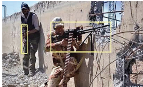
Strategic intelligence / Counter terrorism