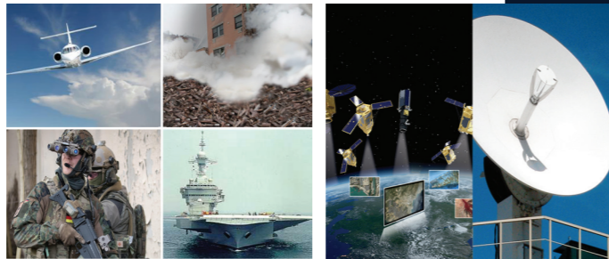
Multi-INT and IMINT GEOINT centers

Airbus Defence and Space Australia, Brazil, China, Finland, France, Germany, Hungary, Singapore, Spain, United Kingdom, United States